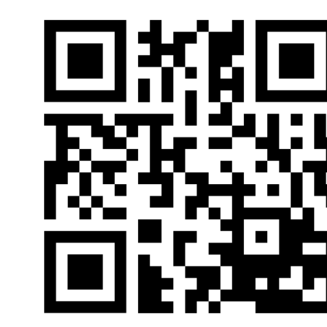
Info for Parents and Carers