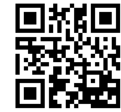
How can headspace Help

Scan the QR Code for a PDF Copies of our Youth Friendly Fact Sheets