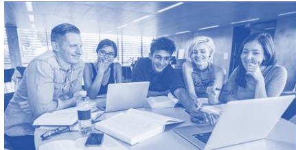
University or VET